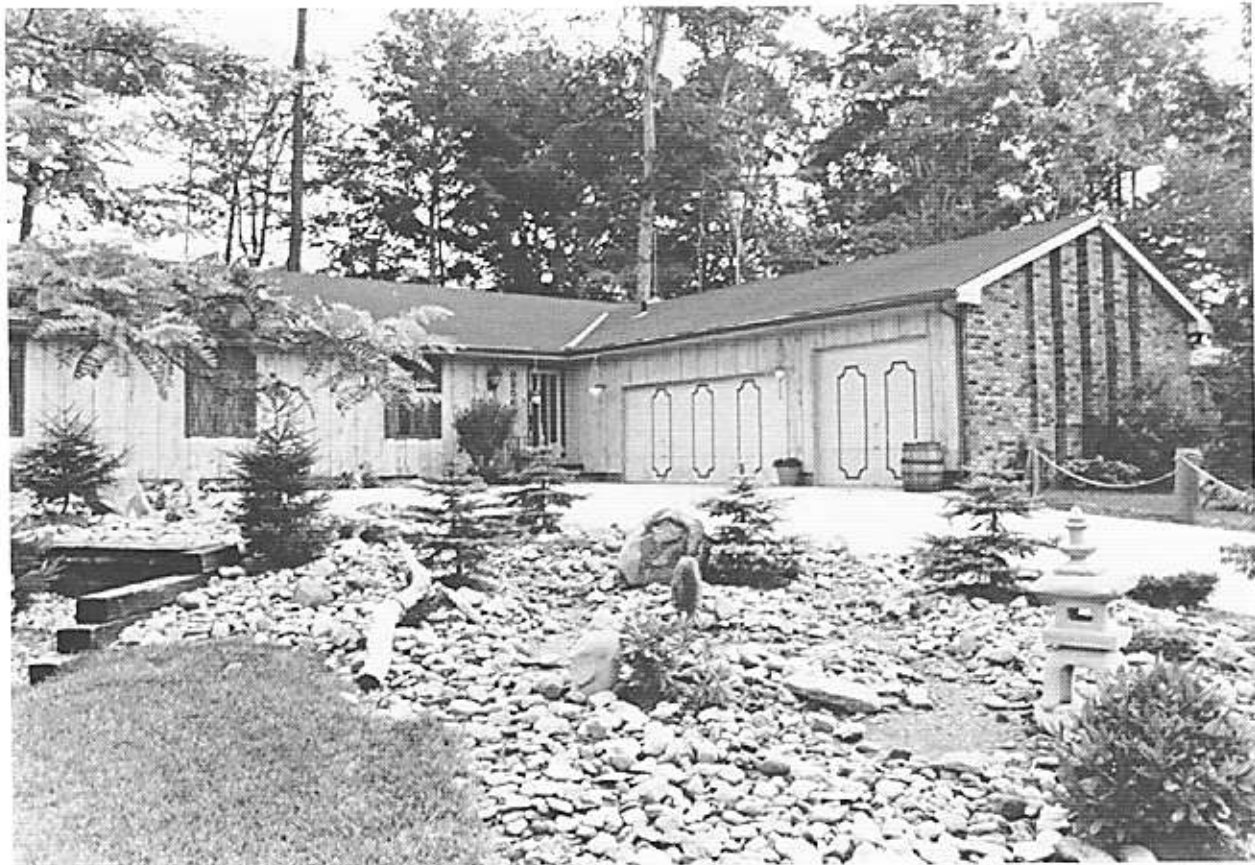
Ranch house* with a Japanese garden in front. Shown in Solon.