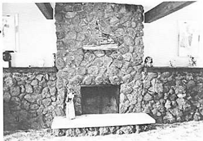
Family room in Solon ranch has stone fireplace.

There is a large basement with an energy-efficient heat pump which provides air conditioning when the pump is reversed.